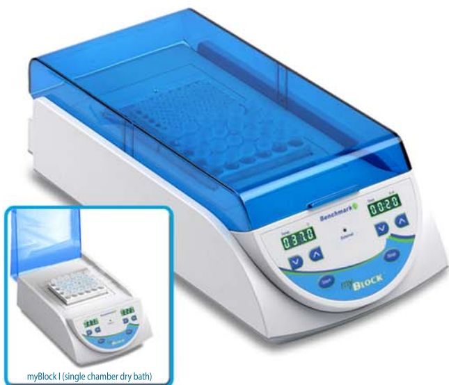
myBlock I (single chamber dry bath)

Benchmark's myBlock series is a "next generation" product line that introduces several major advantages over traditional dry baths. They are the first digital dry baths to include advanced microprocessor controls, timed or continuous operation and a removable hinged lid. In addition, an optional external temperature feedback probe can be positioned directly inside a sample tube, providing real-time control and monitoring of actual sample temperature .