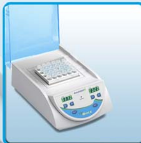
myBLOCK I Single Block Capacity