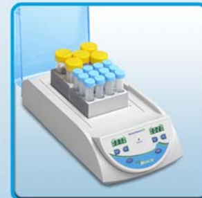
myBLOCK II Dual Block Capacity